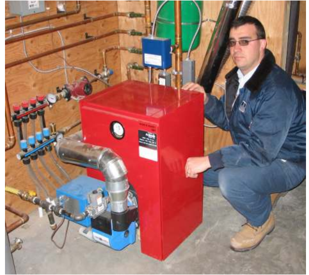
Biasi B-10 boiler with a Heat Wise SU-2A Gas Burner set-up for sealed combustion. This sealed combustion set-up can be used for either chimney or direct vent installations.

Option 3: Direct Vent with Sealed Combustion. This is a great option when considering both new installations as well as retrofits. Many new installations do not have the space for a chimney. Some contractors choose to remove the existing chimney and replace it with a direct vent kit rather than re-using the old chimney.